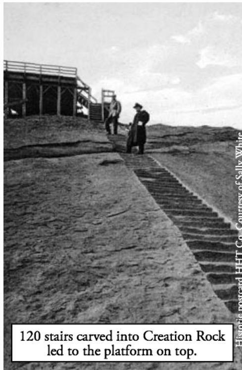
120 stairs carved into Creation Rock led to the platform on top.

The walk through the Park of the Titans, past those stupendous formations where the very Titans themselves might be concealed in labyrinthine caves, is the most perfect foreground for the railroad that every person blessed with even the faintest glimmer of imagination could wish.